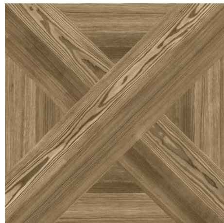
0424011 DECOR NOCCIOLA 1/2/3/4 60x60