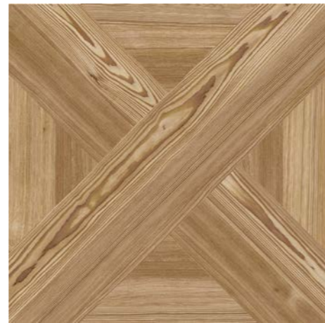
0424010 DECOR MIELE 1/2/3/4 60x60