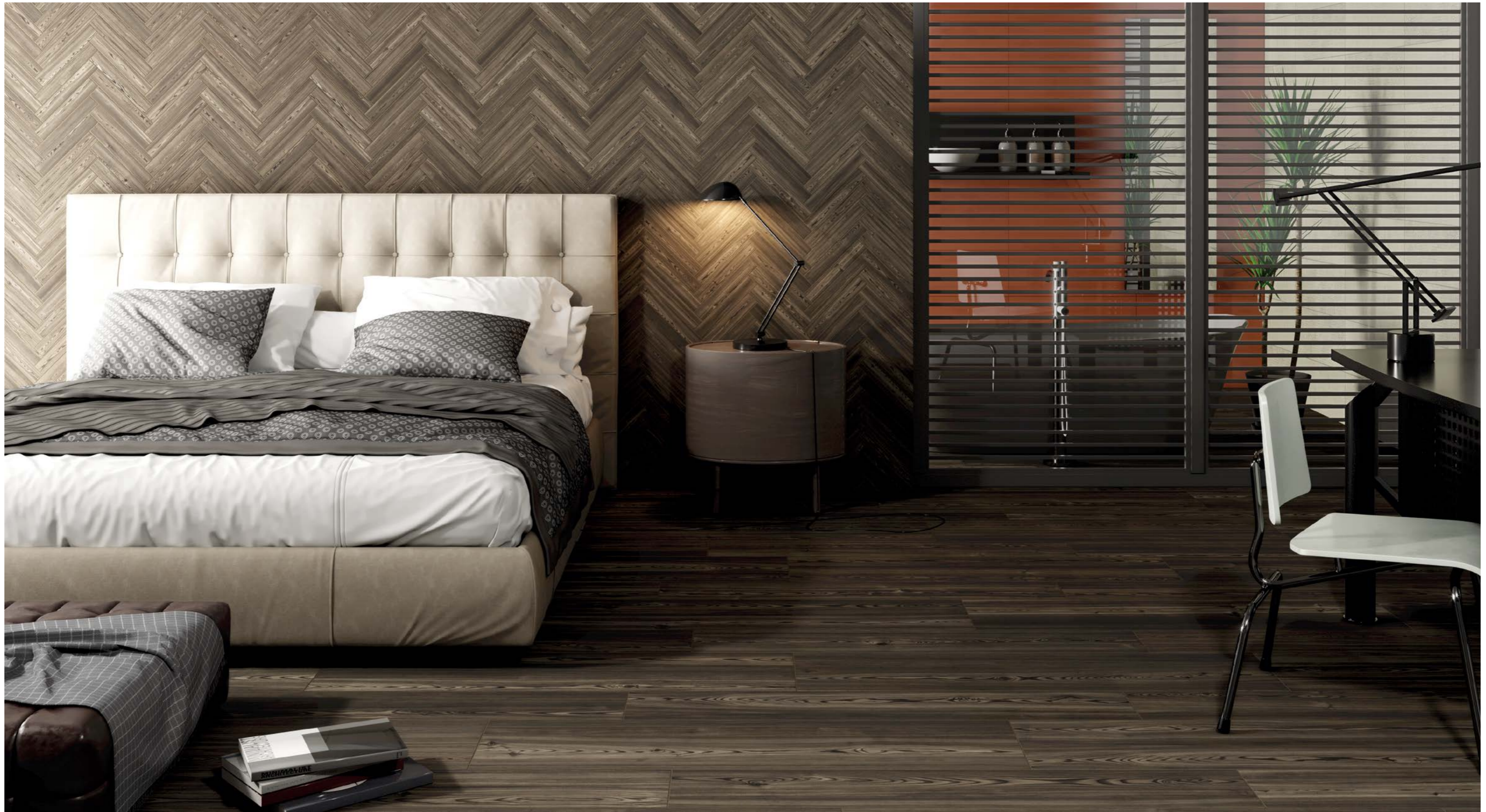
Tabacco - Mosaico Herringbone Tabacco