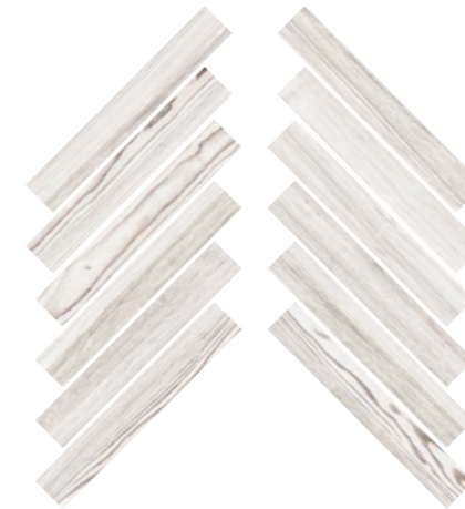
0424020 MOSAICO HERRINGBONE MANDORLA 28x59