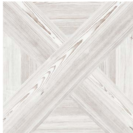
0424009 DECOR MANDORLA 1/2/3/4 60x60