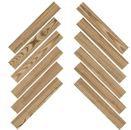
0424019 MOSAICO HERRINGBONE MIELE 28x59