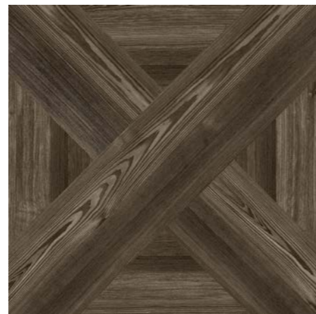
0424012 DECOR TABACCO 1/2/3/4 60x60