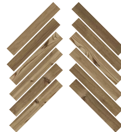
0424021 MOSAICO HERRINGBONE NOCCIOLA 28x59