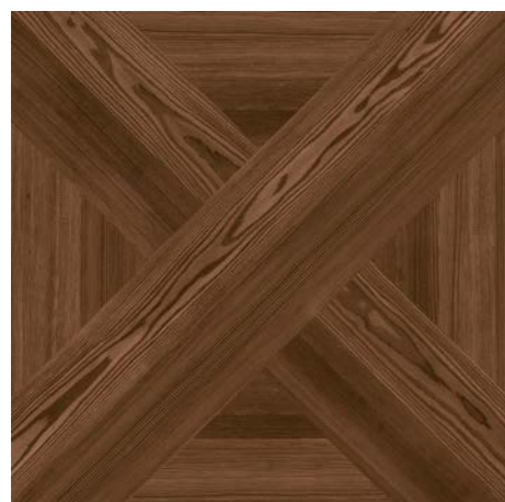
0424015 DECOR CHERRY 1/2/3/4 60x60